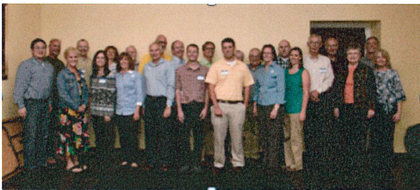
CDS Board and Advisory Council and Spouses on October 20th in Atlanta

On Friday, October 20, the CDS held their yearly, official Board Meeting at the First United Methodist Church in downtown Atlanta. Here are highlights: