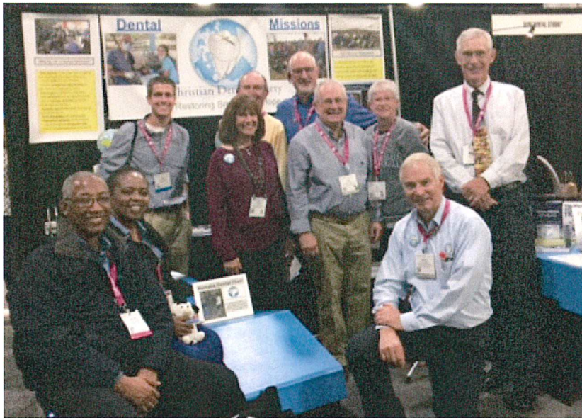
CDS Members and Guests at CDS Exhibit Booth in Atlanta with ADA