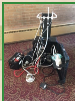
CDS's Modified Aseptico