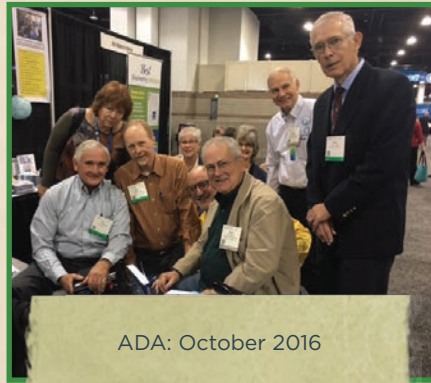
ADA: October 2016