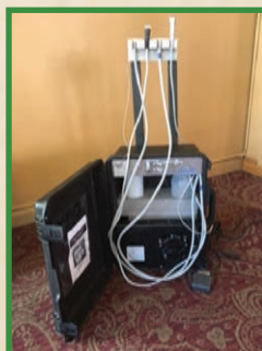
Bell Dental Portable