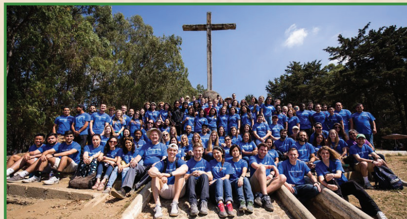
Guatemala March 2016 80 Students

Non-Profit Org. Pre-Sorted Standard U.S. POSTAGE PAID Permit No. 50 Sumner, IA 50674