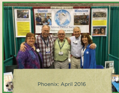
Phoenix: April 2016

CDS Members assist mPower and I-Tec in training indigenous Christians to extract teeth and to help in other ways where there are no dentists. We thank all of our Members who do missions and contribute in so many ways to making the world a better place and who point the way to Christ using their God-given dental skills.