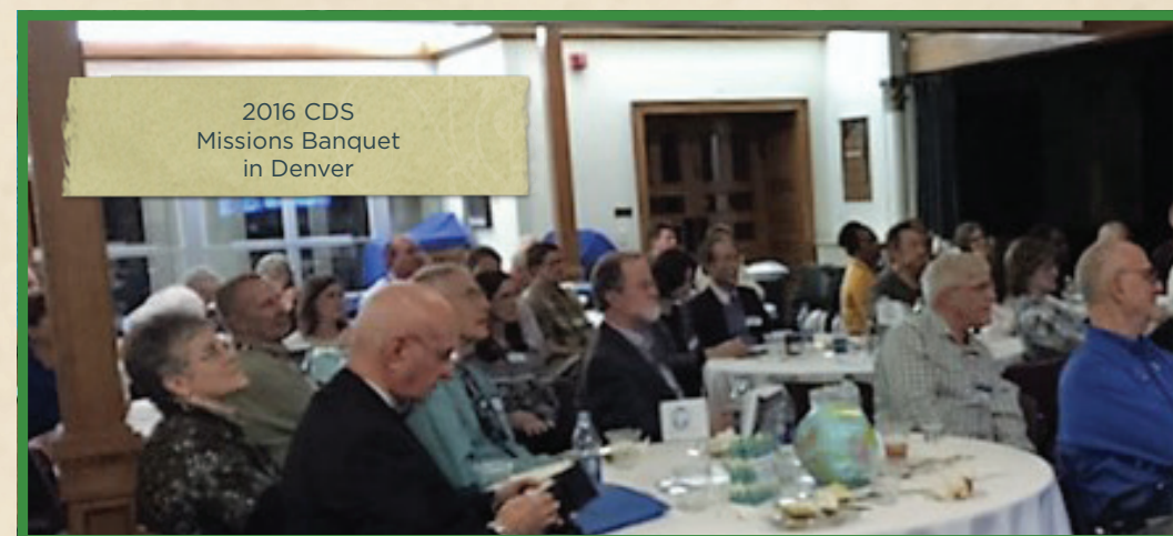
2016 CDS Missions Banquet in Denver