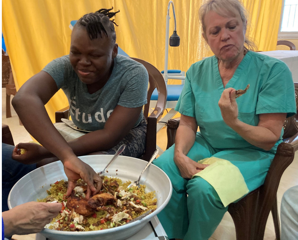
Lunch, African style eating only with their right hand or a big spoon

The Lord was with us every step of the way, especially in receiving the airline checked bag of surgical instruments a day late, without which we would not have been to do what we did. We found two hotel rooms in Newark when our connecting flight to Miami was canceled along with all other flights going to south Florida due to bad weather. A special thanks to the many family members who were praying for us.”