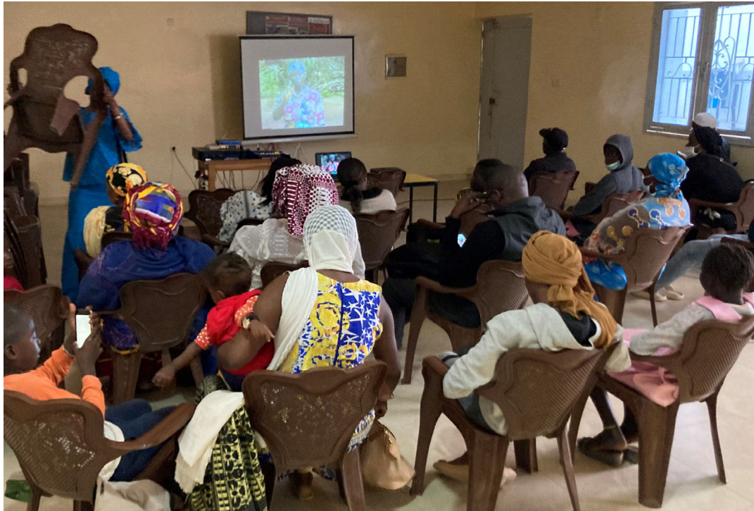
Patients waiting for dental care watched the Jesus film.

There were also people from the community and many Muslims coming and receiving care while hearing about Jesus. I never heard of any objection to any of us “Christians” being there. We had a prayer table where the patients who were interested could come and sit and talk with the pastor or a church member about the Lord and several professed faith in Christ. Certainly, many seeds were sown in the hearts of those who were receptive.