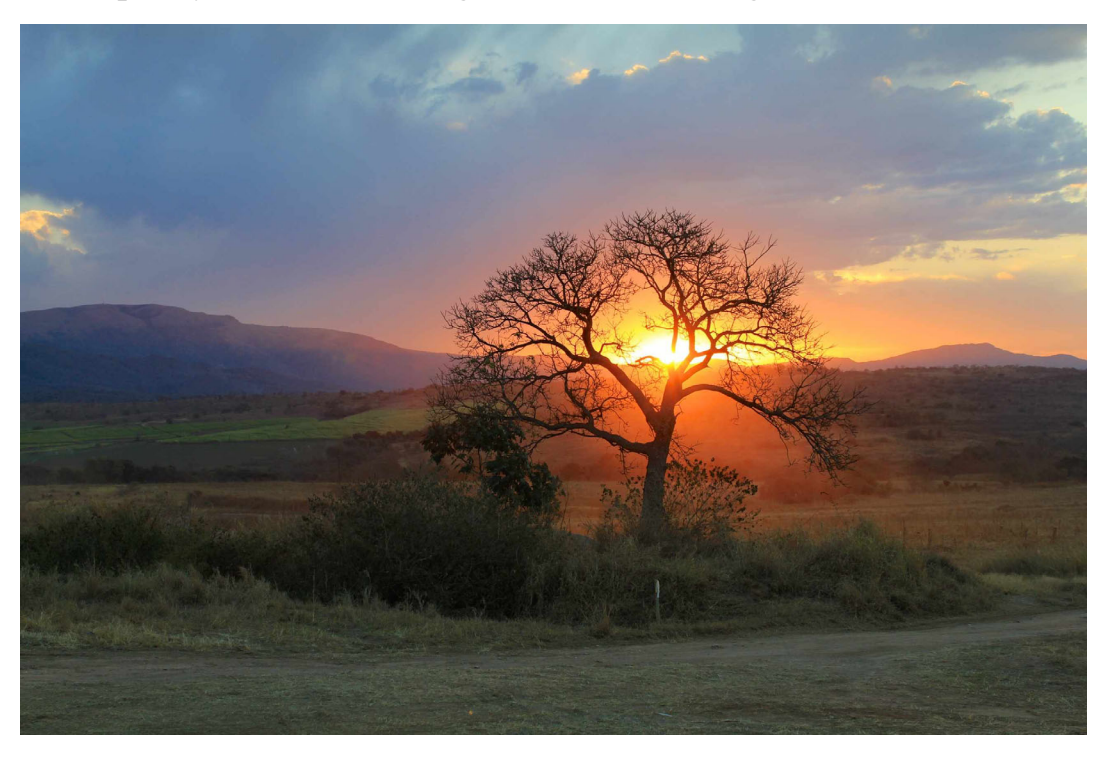
"Therefore, as it is written: 'Let the one who boasts boast in the Lord." 1 Corinthians 1:31

There were no visas, requirements, or problems going into the Dominican Republic and all three flights on American Airlines going and coming were on time. To get back into the United States, team members had to have a negative COVID-19 test within two days of departure, which was readily available. When traveling on missions, ask for the missionary fare (or use an agent who does missionary fares) because AA will give three checked bags free, United gives two free bags, and British airways gives three free bags. Check with other airlines to see their policy since this is a significant cost savings.