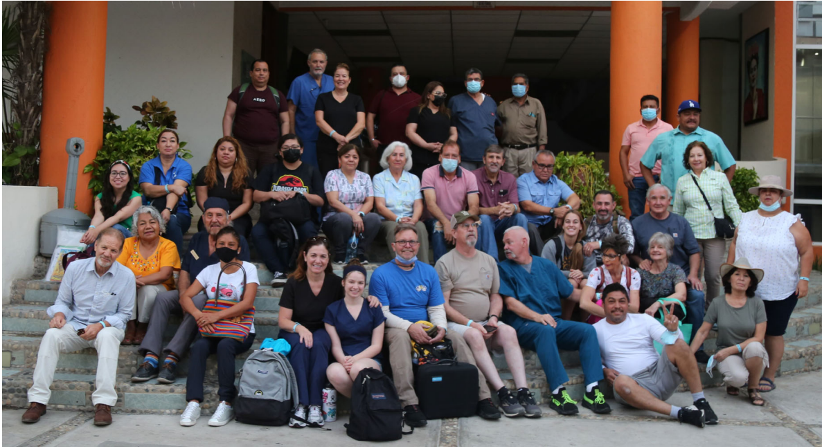
The Oaxaca dental/medical/vision team

The team consisted of 32 Americans with six dentists, one hygienist, seven dental assistants, two sterilization attendants, three pharmacy staff, two eyeglass technicians, four health check and triage personnel, and one physician. Other team members included pastors, translators, and children's ministry workers. This trip was special in that three Mexican dentists from Mexicali attended. It feels good to have local dentists get involved and they did a great job.