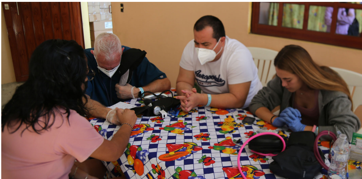
The power of prayer is an essential element of every mission

The team consisted of 32 Americans with six dentists, one hygienist, seven dental assistants, two sterilization attendants, three pharmacy staff, two eyeglass technicians, four health check and triage personnel, and one physician. Other team members included pastors, translators, and children's ministry workers. This trip was special in that three Mexican dentists from Mexicali attended. It feels good to have local dentists get involved and they did a great job.