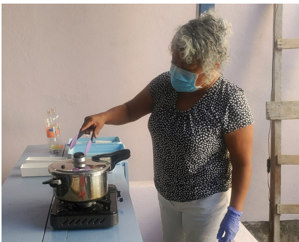
Pressure pot sterilization

Our fourth clinic day was very busy in a small church near Puerto Escondido. We took out some third molars and a portable x-ray, sensor, and computer software made the extractions easier. We could see what we were getting into and could formulate a game plan.