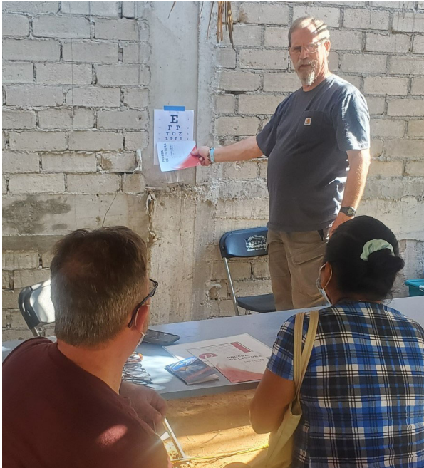
The eyeglass team

impressed that ten percent of the population goes to church. We had interpreters that translated from Chachino to Spanish to English. The weather remained comfortable and the scenery was beautiful.