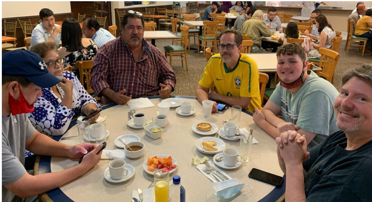
Breakfast at the hotel

Wednesday and Thursday, we set up clinic inside the pastor's compound in La Gloria. There was more room to work with good electricity, but no running water due to the freezing weather in February. Fortunately, we had cases of bottled mineral water. The clinic in La Gloria was full of patients and the chapel was larger, so more patients could sit in the air conditioning and share their stories and hear about the Way, the Truth, and the Life.