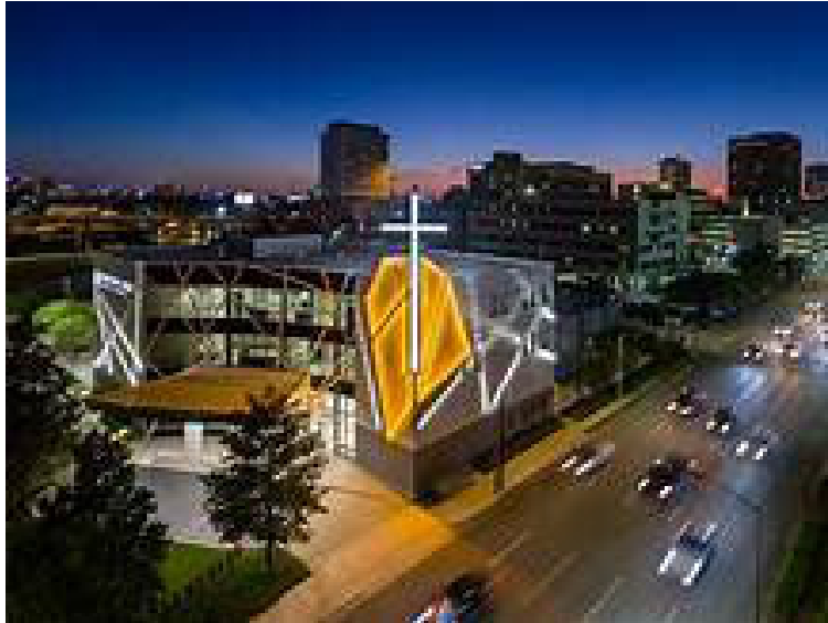
Picture of Houston 1 st Baptist Church Downtown Campus

The CDS will be exhibiting and speaking at the Global Medical Missions Conference in Irvine, California from October 21-22. CDS will also exhibit at the largest dental meeting in the United States at the Greater New York Dental Meeting at the Javits Convention center in Manhattan on November 27-30. CDS members will have a booth at the Rocky Mountain Dental Convention in Denver, Colorado on January 19-21 and members will be speaking on the 20 th . Please consider joining CDS members for a few hours at an exhibit booth or just drop by to say hello.