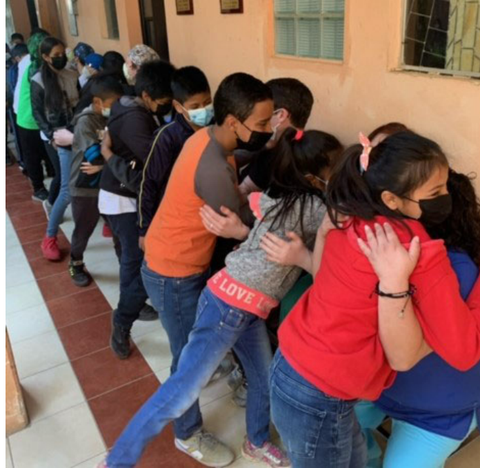
Children arriving and sharing their love in Guatemala