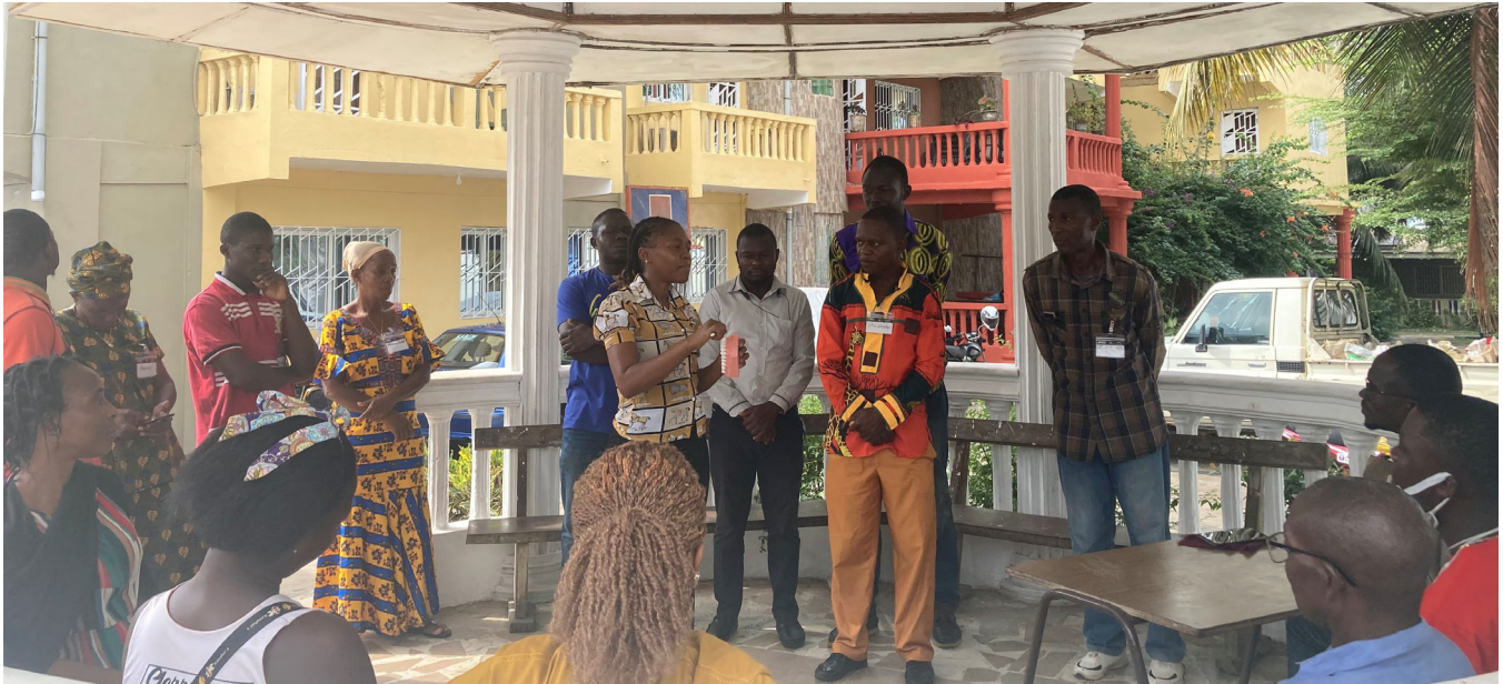
Dental trainees giving hygiene/Gospel presentations to patients awaiting treatment.

the progression of caries—from the enamel to the dentin to the pulp and eventual pulpal necrosis.