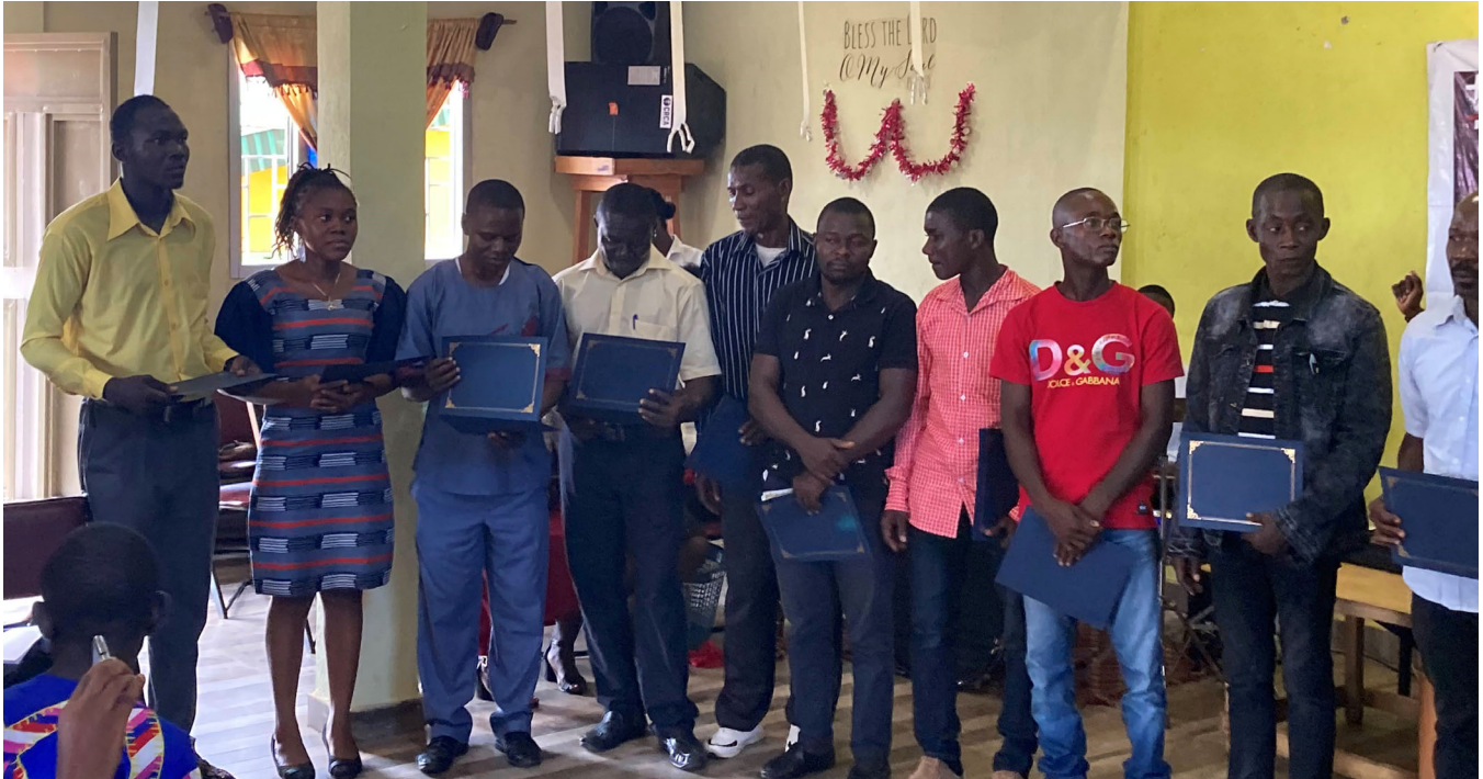
Students at the graduation ceremony on Easter Sunday