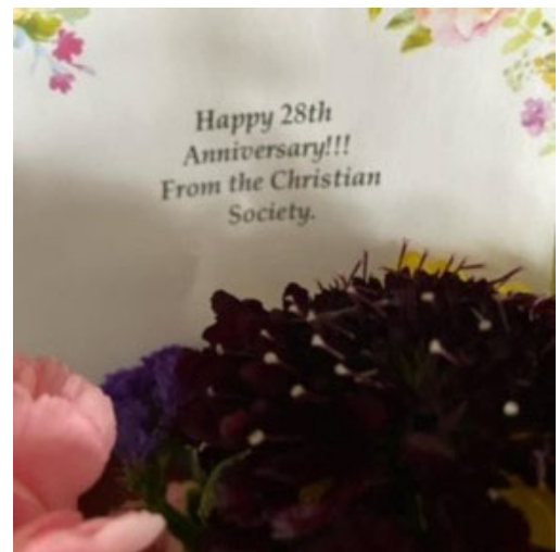
Tina received thanks and flowers from the CDS